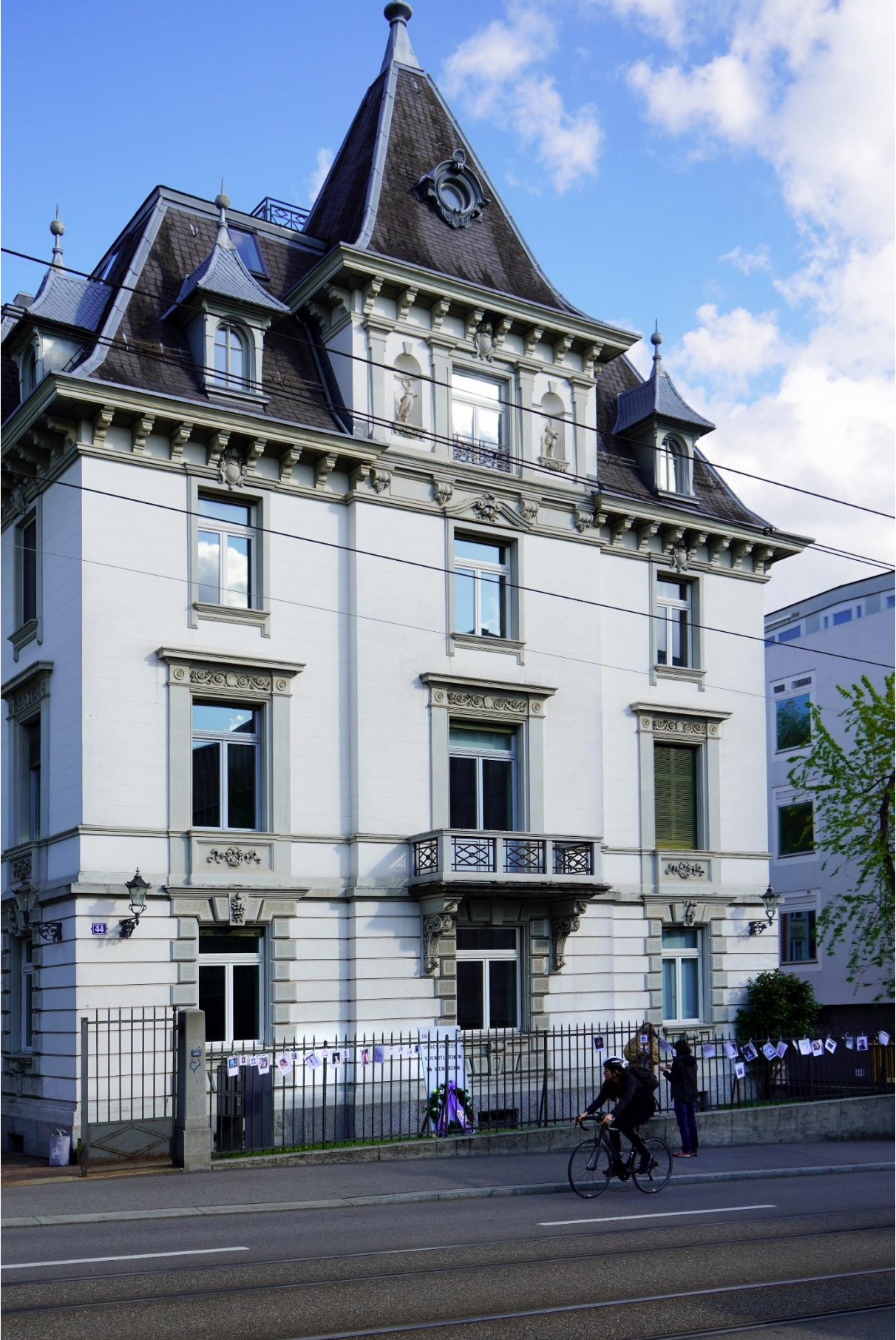
DER UNBEKANNTEN KÜNSTLERIN*, April 2021, vis à vis Neubau Kunsthaus Zürich